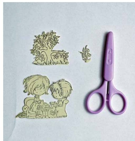
3 Cut them out neatly