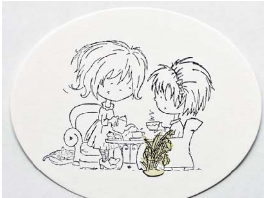
6 Stamp the image of Daisy and her friend on top