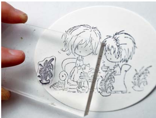
8 The flowers at the sides can be stamped without masking