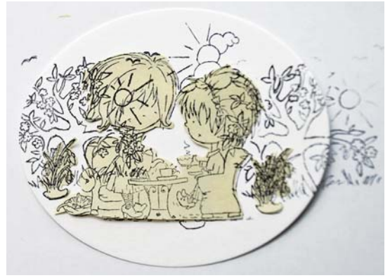
12 Now remove all masks