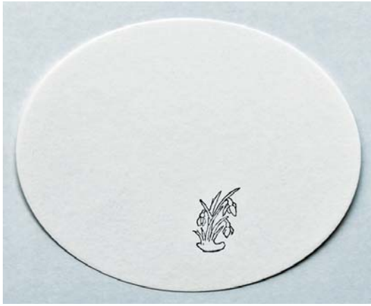
4 First stamp the image in front