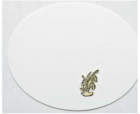
5 Mask the stamp with the cut-out image