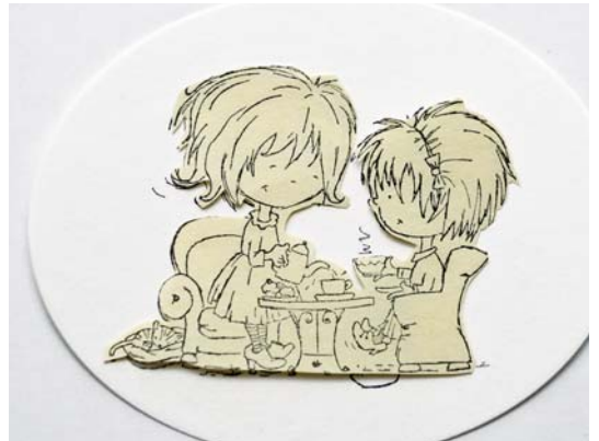
7 Mask the image