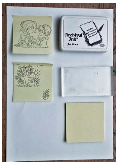
2 Stamp the images on a Post-it