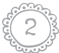
image to it. Staple a piece of jute and the stamped image to the card. Cut a scalloped oval from kraft card and white card. Cut the scalloped border from the white oval and stamp the text. Attach all layers to the bag. Fold the top 2 cm down, attach it with a clip and ribbons.

Cut the Creatable lace border twice from white card; turn it into a single-fold card with the fold on top. Cut a pink 12.3 cm Ø pink circle and an 11.5 cm Ø one from design paper; layer them together and cut an 8.3 cm Ø circle from its centre. Use the Craftable to cut out a white scalloped circle. Layer them onto the circle border. Stick the layers to the card. Stamp the image, colour it in and