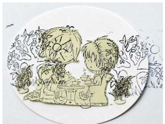
10 Result up till now