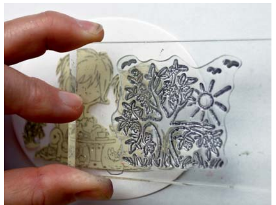
9 Mask all images carefully when stamping the flowers