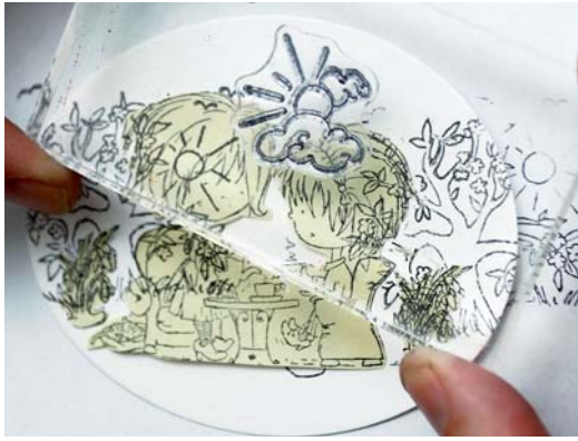
11 Stamp a sun