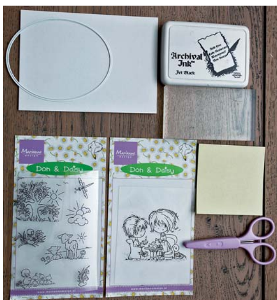
1 This is what you will need

our it in. Cut it out with the oval die and stick it to the inside of the card. Punch two holes into the top of the card and thread a ribbon through them. Finish the card off with branches and flowers.