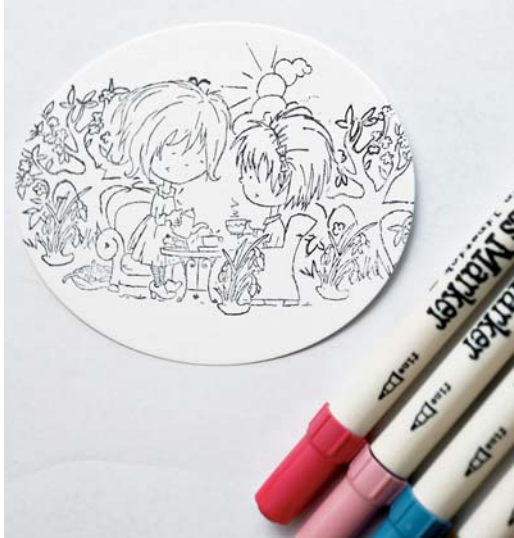
13 The image is ready to be coloured in.