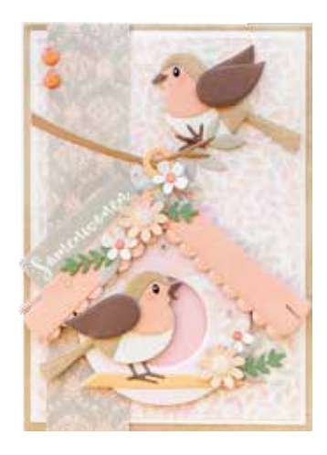
Extra for this card: Collectables: COL1534 (Eline's Garden Birds), Gelpen: wit

Cut a 14 \times 14 cm kraft top-fold card and adhere 13.5 \times 13.5 cm design paper on top. Die cut the background sprig (CR1652) from pearl paper and cut a 14 \times 3.5 cm strip from design paper. Adhere the layers together. Die cut the birdhouse from different colours and cut out the opening. Die cut a feather and adhere together with the birdhouse. Die cut the bird from different colours, adhere together and position near the birdhouse. Die cut flowers and leaves and use them to decorate the birdhouse. Place a matching enamel dot in the heart of each flower. Die cut a green banner and follow the general instructions.