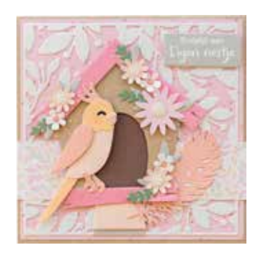
Extra for his card: Craftables: CR1652 (Background Sprig), Creatables: LR0854 (Feather by Marleen), Collectables COL1465 Eline's Birds, Pearl paper: CA3166 (white)

Cut a 14 \times 14 cm kraft top-fold card and adhere 13.5 \times 13.5 cm design paper on top. Die cut the background sprig (CR1652) from pearl paper and cut a 14 \times 3.5 cm strip from design paper. Adhere the layers together. Die cut the birdhouse from different colours and cut out the opening. Die cut a feather and adhere together with the birdhouse. Die cut the bird from different colours, adhere together and position near the birdhouse. Die cut flowers and leaves and use them to decorate the birdhouse. Place a matching enamel dot in the heart of each flower. Die cut a green banner and follow the general instructions.