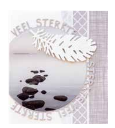
Extra for this card:

Craftables: CR1649 (Sterkte Cirkel by Marleen), Creatables: LR0854 (Feather by Marleen), Decoupage sheet: VK9609 (Serenity Horizons)