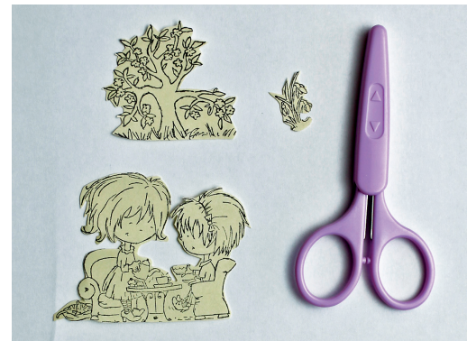
3 Cut them out neatly

Tutorial by Wilga van 't Zelfde mypaperpasion.blogspot.nl