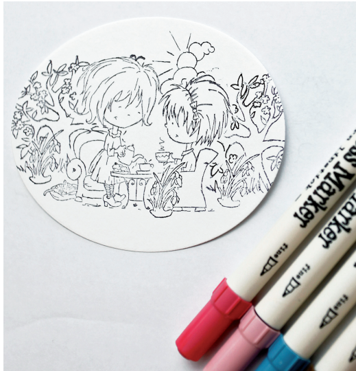
13 The image is ready to be coloured in.

By Marleen van der Most handmadebymarleen.blogspot.nl