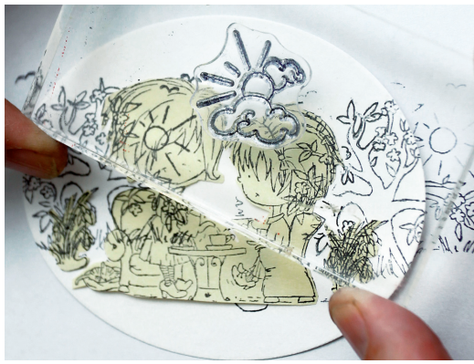
11 Stamp a sun