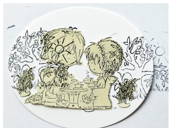
10 Result up till now