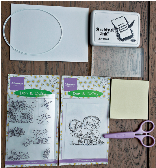
1 This is what you will need

To stamp a partial image, use the 'masking' technique and create layered, interacting images.