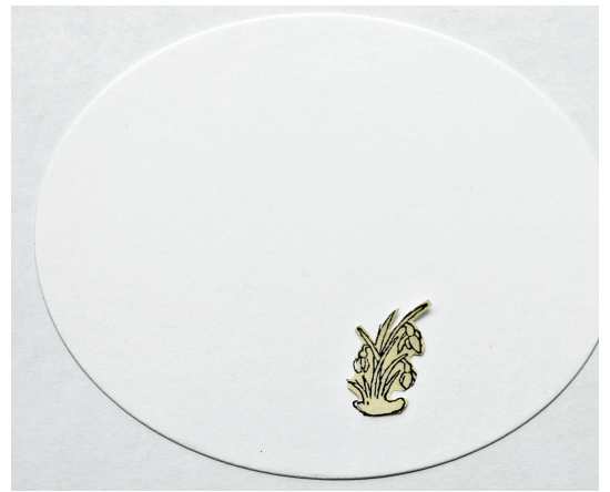
5 Mask the stamp with the cut-out image