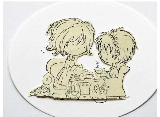
7 Mask the image