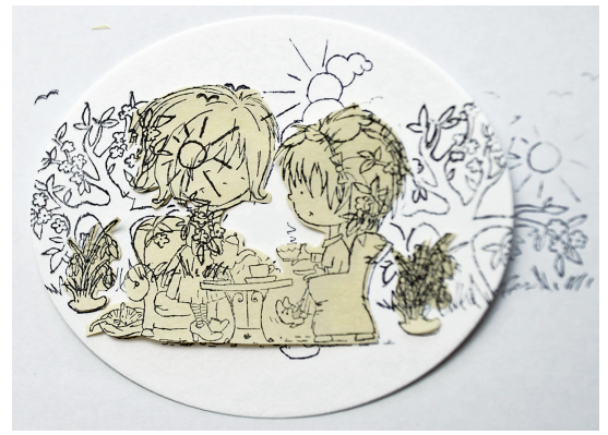
12 Now remove all masks