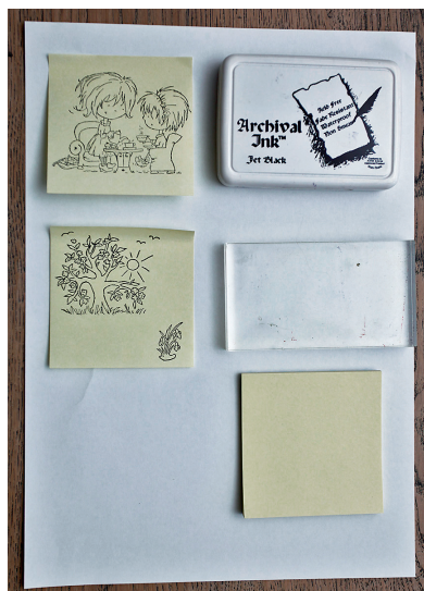
2 Stamp the images on a Post-it