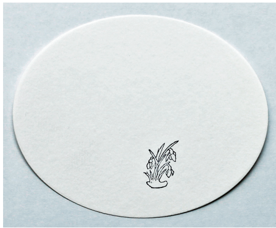
4 First stamp the image in front