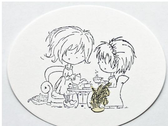
6 Stamp the image of Daisy and her friend on top