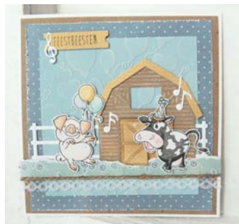
15 x 15 cm

Trace the pattern onto pearly white card and cut out. Cut 2x: 4.5 x 12 cm design paper and adhere to the narrow sides. Cut 2x: 8.5 x 12 cm design paper and adhere to the front and back. Score the fold of the bag also over the design paper to make folding easier after the bag has been pasted together. Cut 7,5 x 10,5 cm design paper, work the edges with the distress tool and adhere. Adhere the design paper to the flap of the bag. Paste the bag together and thread a ribbon through the holes; tie into a bow. Finish off.