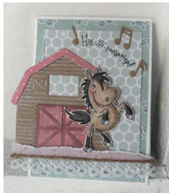
10.5 x 12.5 cm

Die-cut and embossing machine, Inkpad: Memento tuxedo black , Papicolor card: Recycled kraft grey (322), Original pearly white (930), Ribbon: JU0949 (Maritime rope), Derwent Colorsoft pencils, Distress tool, Stump, Pencil blending solution, White fineliner