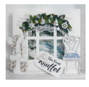
Extra needed for this card: Creatables: LR0440 (Knitted hat and mittens), Inkpad: black, Decoration paper: CA3104 (snow paper), CA3127 (silver), CA3122 (silver glitter)

Cut a narrow piece of paper and adhere with foamtape, creating a flower box and fill it up with holly leaves.