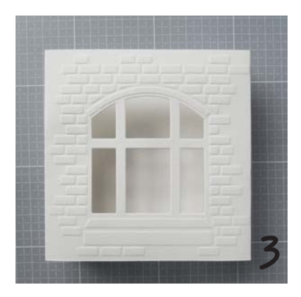
• Fold the window and paste the narrow strip to the reverse side.