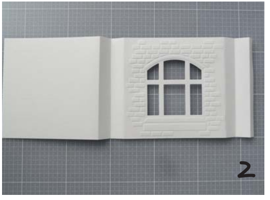
Die-cut and emboss the template. Score on each side at 1.5 and 3 cm in from the edge of the template.