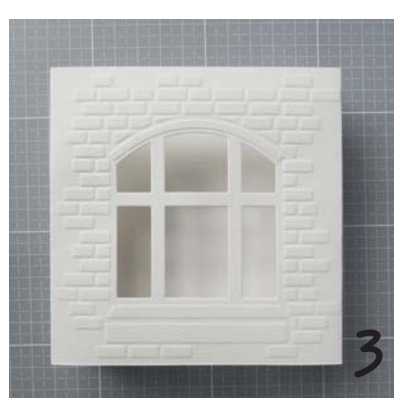
Fold the window and paste the narrow strip to the reverse side. Work the embossed bricks with Memento pink and the window sil and edges of the card with distress ink.