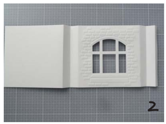
Die-cut and emboss the template. Score on each side at 1.5 and 3 cm in from the edge of the template.